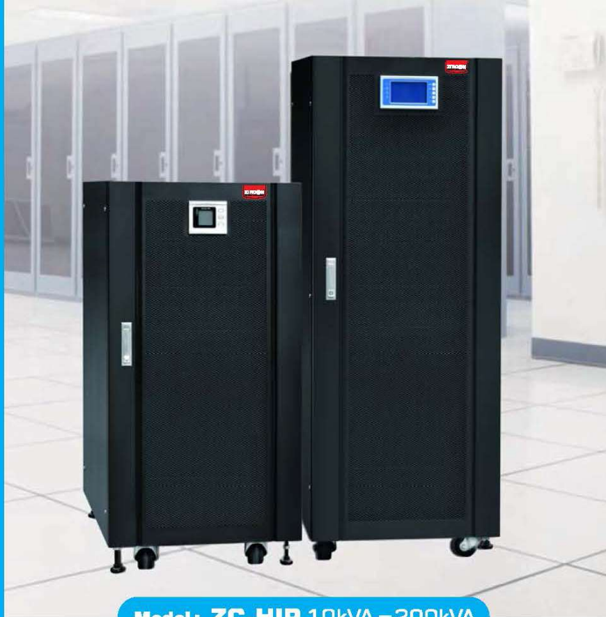
Model: ZC-HIP 10kVA – 200kVA